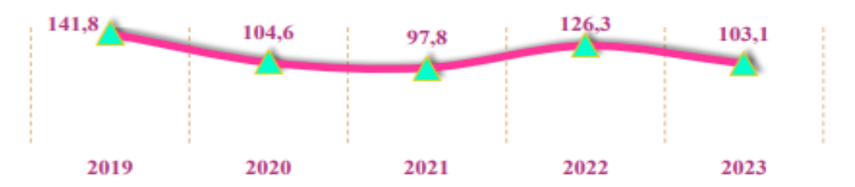
Dynamics of growth rates of investments in fixed assets for January-March, in %

Currently, one of the most important tasks in the field of economic development is to create favorable conditions for attracting foreign investments to the economy of our country, to introduce practical mechanisms for their legal protection, and to further improve the investment environment.