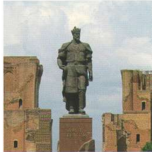
138-rasm. Amir Temur haykali Shahrisabz shahri (1996 y.)

Majestic sculpture includes important historical events related to the art of architecture, monuments and sculptural ensembles erected in order to perpetuate the memory of famous people, and these have independent importance and express a great meaning in themselves.