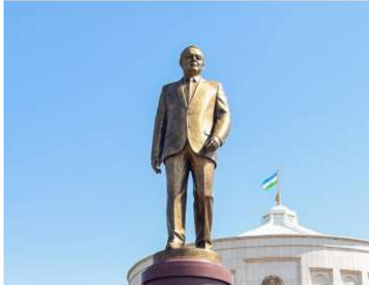
Figure 3: Tashkent city. Islam Karimov

Such statues are erected in order to commemorate historical events or the names of famous individuals. Majestic sculptures are designed to be seen from afar and are created in a generalized way in connection with the environment.