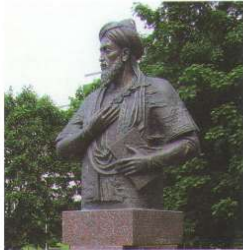
158- rasm. Ibn Sino haykali Latviya, Riga shahri, (2006 y.)