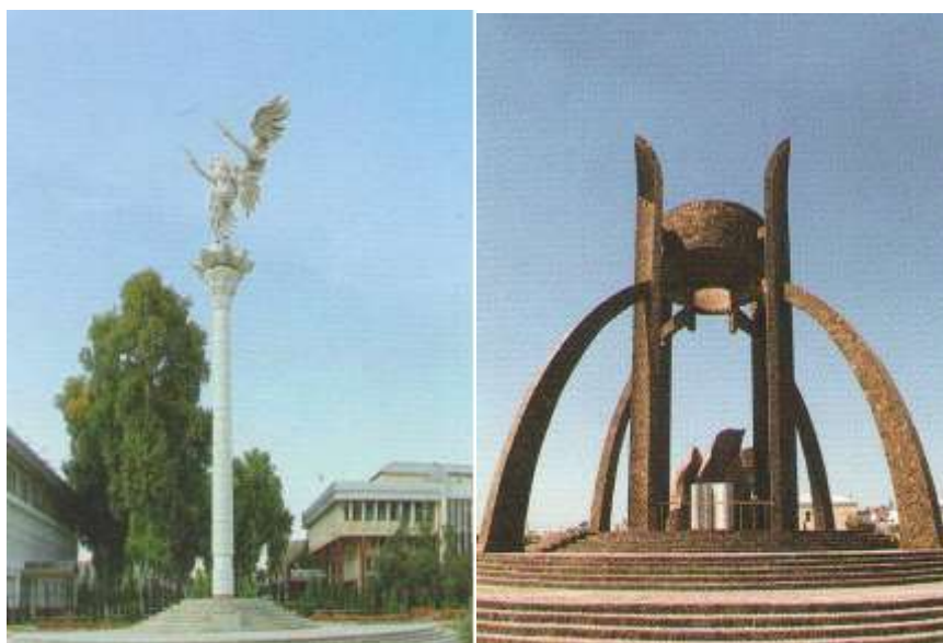
Figure 4: "Stella of Peace" Namangan city 2007

Majestic decorative sculptures are used to decorate streets and squares, buildings and parks, fountains. They depict people, animals, fish and birds. Since these statues are large in size, they can easily be seen from afar. The overall size, volume, and proportions of the magnificent works are adapted to the environment, nature, and buildings.