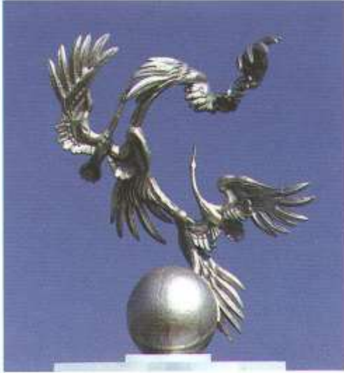
157- rasm Mustaqillik va ezgulik monumenti Toshkent shahri (2005 y.)