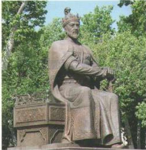
137-rasm. Amir Temurhaykali Samarqand shahri (1996 y.)

Majestic sculpture means monumental, that is, majestic sculpture. They are installed in the square and streets for the general public.