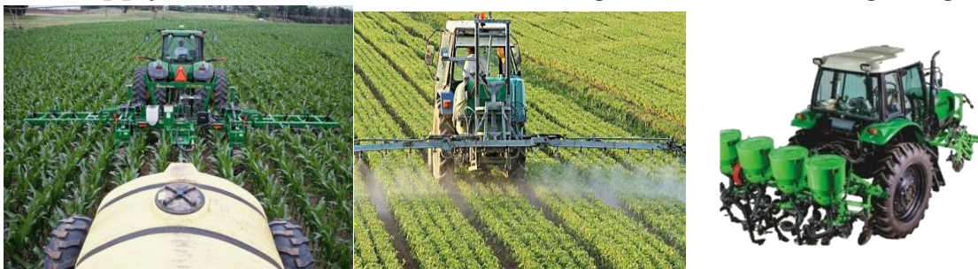
Figure 1.1. Mineral fertilizing machines.

The greater the amount of nutrients in the soil of plants, the less their need for fertilizers, and if less, it increases. The supply of nutrients and their appropriate forms are not the same in different types of soil. Therefore, the need for fertilizers in different soils is not the same. If local solid and liquid fertilizers are mainly sprinkled on the soil before plowing, the fast-growing green grasses planted in the fields are crushed and sprinkled on the surface after growing in sufficient quantity, plowed with plows and mixed with the soil. Currently, animal waste (manure) and compost (a mixture of manure, plant stems and various waste) are widely used as the main local fertilizers. Preparation and application of solid local fertilizers are carried out in two ways: directly (farm-field) and in the form of collection in one place (farm-storage place-field). In this case, local fertilizers are mainly loaded from the storage places of livestock farmers to the transport vehicle and they are transported to the storage place prepared at the beginning of the field. Then they are stored in that place until the time of application and when necessary, they are put into the soil. In non-saline fields, before plowing, solid and liquid local fertilizers are applied to the surface of the land, and then plowing is organized. It is advisable to apply to the saline areas after washing off their salt during tillage.