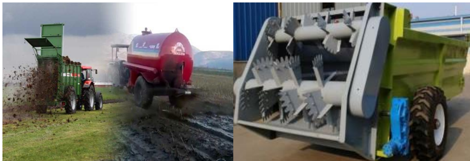
Figure 1.2. Organic fertilizing machines.

The structural elements of complexes that distribute solid mineral fertilizers include: