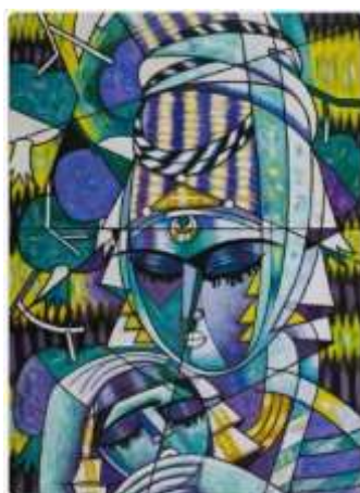
Madonna and Child

The artist Javlon Umarbekov is in constant creative search, experimenting, creating more and more new works. To create for him is like breathing. In his life and work, he created his own trajectory of the path, and many young artists are following him today. Javlon Umarbekov works practically not only in different techniques, but also in all genres, the range of his choice of themes, plots, images, genres is quite large and diverse. Landscapes, still lifes, portraits, historical scenes, as well as conditional compositions reveal different facets of the artist's thematic preferences. He is interested in history and modernity, real and illusory, individual and generalized, resulting in a unique work of art. The peculiarity of the artist's skill is that he can elevate an ordinary motif to the level of generalization. In the artist's works, his inner world is clearly read, creative and constructive, harmonious and balanced, national and universal.